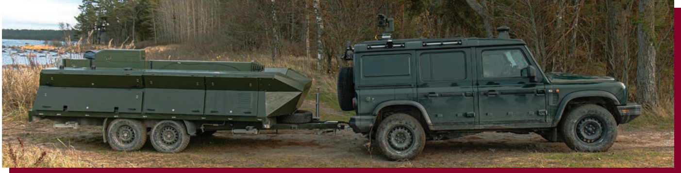
SurveilSPIRE and CAIMAN